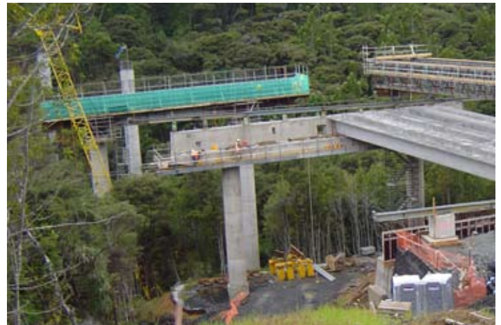
Otanerua Viaduct At 256 metres long and 25 metres wide and a cost of $10 million, the Otanerua Viaduct towers 35 metres above the Otanerua Stream. Each span of the bridge deck comprises ten 1.5 metre deep Super Tee beams covered by a continuous in situ concrete deck slab. Each of the 31 metre long Super Tees were delivered to site by truck and rear powered jinker from Fulton Hogans precast manufacturing yard.